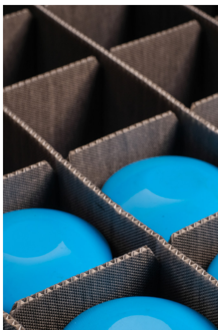
High stacking strength