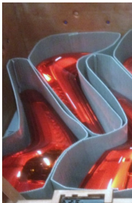
Superb nesting capability

Soft non scratching surface, durable, stiff and flexible, moisture proof, low weight, ECO-efficient.