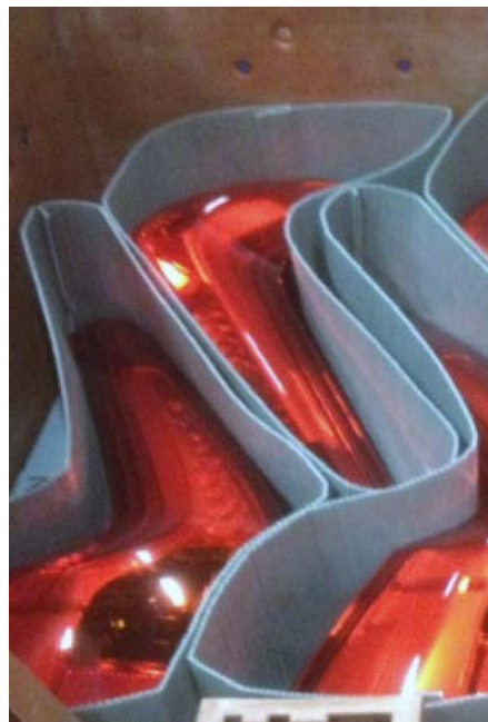
Superb nesting capability