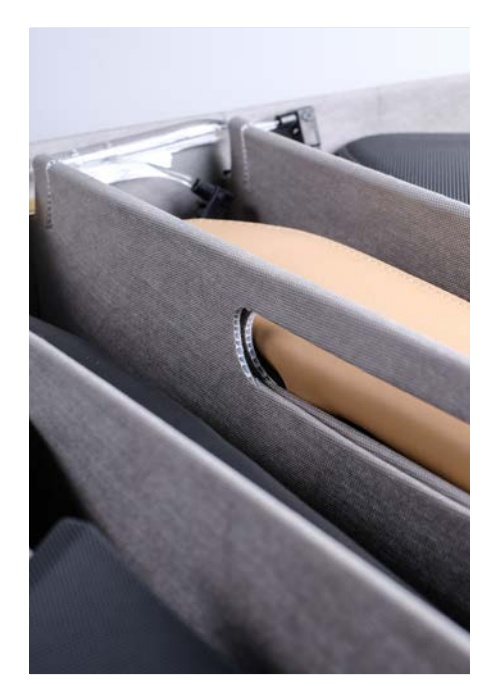
ESD protection High stacking strength