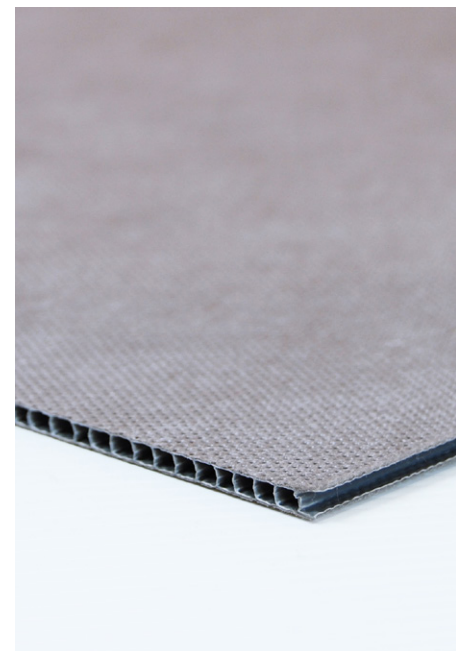
Heat laminated surface - No glue

Contact us for more information, samples or prices.