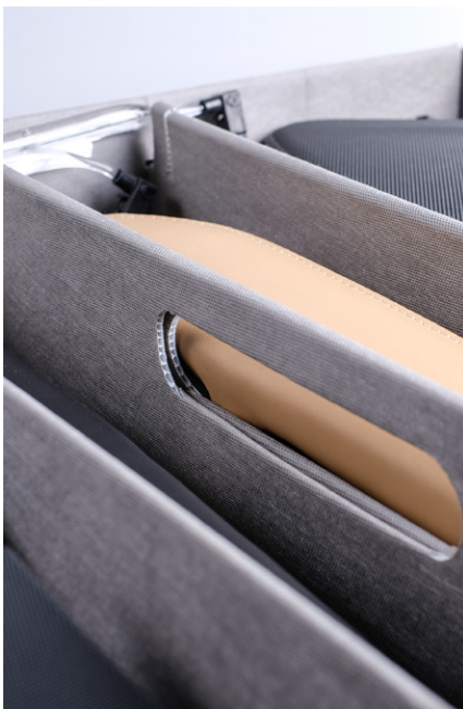
Superb surface protection